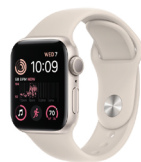
Apple Watch SE GPS 40mm - Starlight*

Reward points can be redeemed at any time. See medicom.com/safeadvantage for complete rules and regulations.